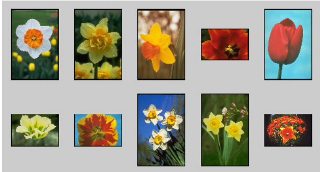
Fig. 2 Retrieval results of flowers.