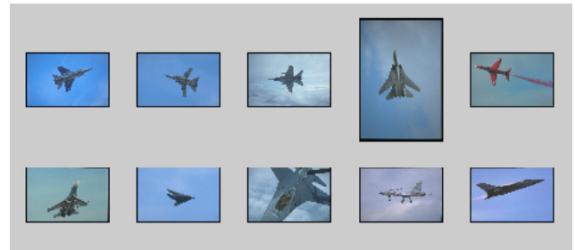
Fig. 1 Retrieval results of battle planes.

In Fig. 3, we test our algorithm on the collection of 2,000 animal images. The experimental result further verifies the effectiveness of the algorithm.