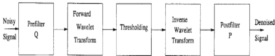
Figure2: Diagram of wavelet based image De-noising

All digital images contain some degree of noise. Image de-noising algorithm attempts to remove this noise from the image. Ideally, the resulting de-noised image will not contain any noise or added artifacts. De-noising of natural images corrupted by Gaussian noise using wavelet techniques is very effective because of its ability to capture the energy of a signal in few energy transform values. The methodology of the discrete wavelet transform based image de-noising has the following three steps as shown in figure 2. 1. Transform the noisy image into orthogonal domain by discrete 2D wavelet transform. 2. Apply hard or soft thresholding the noisy detail coefficients of the wavelet transform 3. Perform inverse discrete wavelet transform to obtain the de-noised image. Here, the threshold plays an important role in the de-noising process. Finding an optimum threshold is a tedious process. A small threshold value will retain the noisy coefficients whereas a large threshold value leads to the loss of coefficients that carry image signal details. Normally, hard thresholding and soft thresholding techniques are used for such de-noising process. Hard thresholding is a keep or kill rule whereas soft thresholding shrinks the coefficients above the threshold in absolute value. It is a shrink or kill rule.