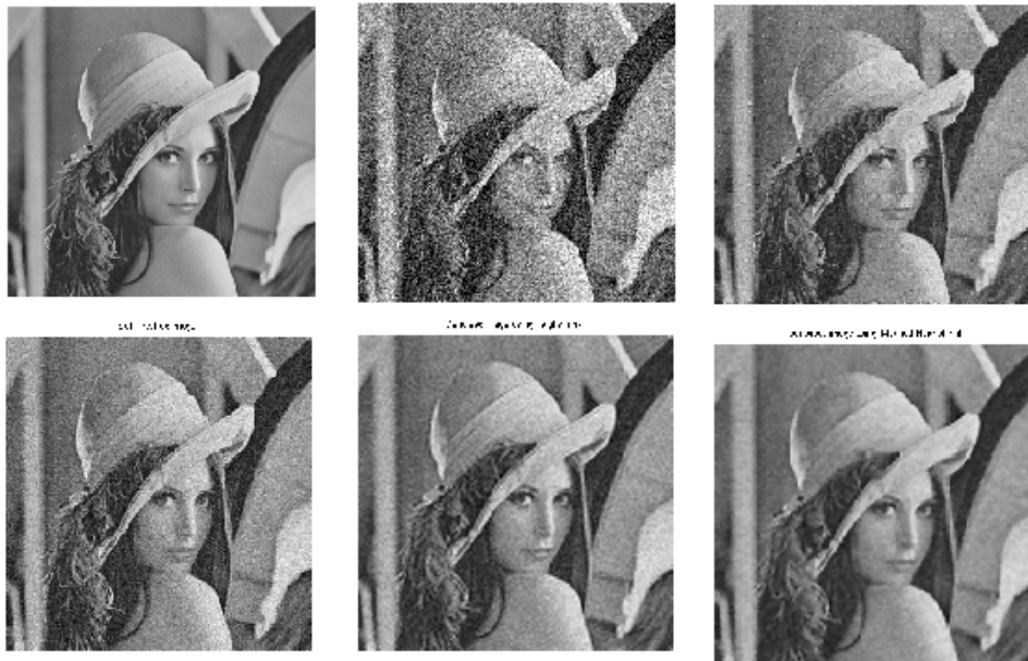
Figure3: Results of various Image De-noising Methods