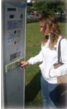
Figure 12: Collecting Parking Information [19]

NFC parking application facilitates user to collect parking information on his/her NFC cell phone by just touching cell phone to NFC tag that gives you the parking service information i.e. location to park your vehicle, parking duration, parking rent. It saves user's lot of time and decreases the queue time in parking lots [19].