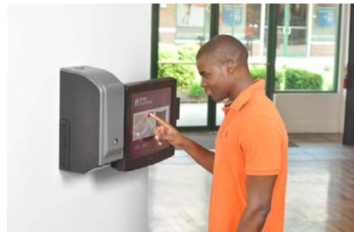
Figure 15 : NFC Kiosk Services [19]

Touch for Kiosk Services Kiosk service facilitates user to get different NFC-based services and applications at a single point. Tag services includes SMS services, call services (Emergency numbers), entertainment activities, train/bus/flight schedule, location information (for visitors) etc.