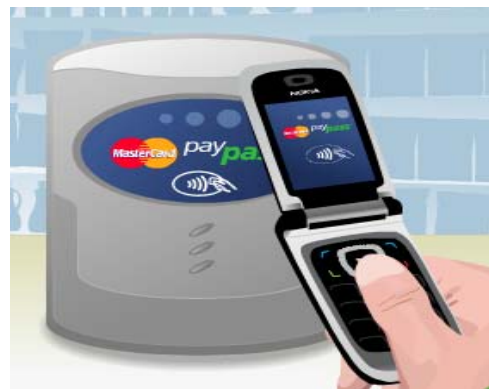
Figure 10: NFC payment [19]

Touch to Pay With the help of NFC users can keep contactless cards and tickets in their cell phones. Instead of keeping tickets and debit/credit cards separately, user can store all the cards and tickets in their NFC equipped cell phone [18]. NFC mobile wallet facilitates by showing current balance, last ten transactions, and works on all contactless readers [19].