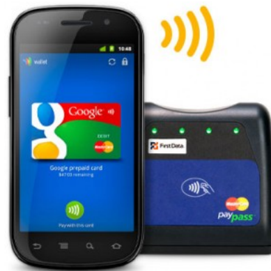
Figure 3: NFC Stickers [20, 21]

simple to use and have potential of gaining significant business benefits. For production and personalization standard they are following A1 credit card format standard. Although NFC stickers can save start up cost, their production cost is more than simple contactless cards. Only the increase in volume of such stickers can reduce its cost. According to a survey volume of NFC sticker is increased in 2009 and during 2010 and in 2011 it is expected that there will be significant increase in their volume, reducing its price [10].