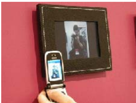
Figure 13: Copying picture from NFC Frame [20]

Touch for Entertainment Accessing web site, transferring/copying data, getting movie advertisements, initiating phone call or sending SMS by single touch, purchasing tickets of concerts, club or cinema, making hotel reservations, storing discount coupons on NFC cell phones and using them later are all part of NFC entertainment. We can buy any entertainment service using M-Wallet on NFC cell phone [19].