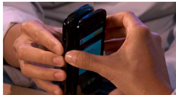
Figure 4: Phone to Phone NFC Transaction [11]

In this category two cell phones equipped with NFC communicate with each other. They can transfer music files or pictures by just touching each other.