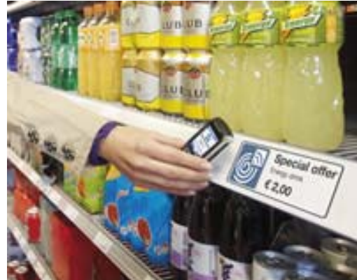
Figure 14: Getting Product Information [21]

etc). Several products could be added to cart and at the end user can view the total price. Even user can keep all the record of previous shopping and can perform comparison like price compare etc. Amount can be paid instantly through NFC phone and user can further store shopping receipt on his/her cell phone. This technology also helps shopkeeper to manage the shelf [19]