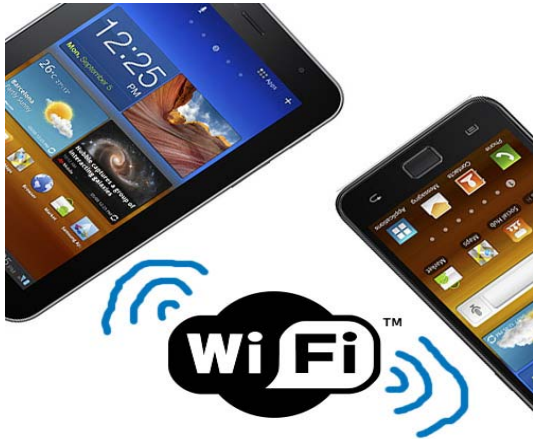
Figure 8: Peer-to-Peer data transfer [3]

Amount of data may not be too large. If user wants to transfer large amount of data, Wi-Fi or Bluetooth connection can be set up, but that is invisible to user [16].