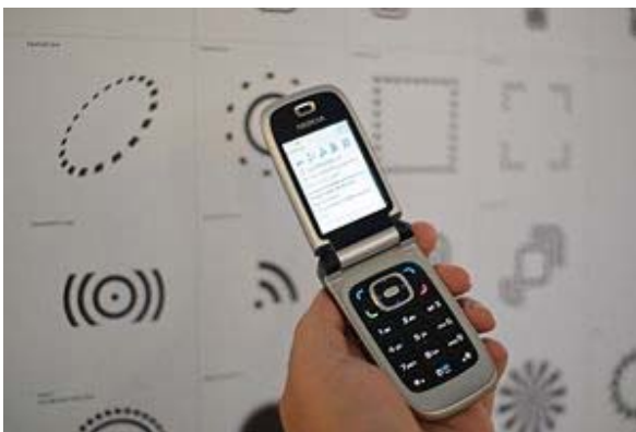
Figure 6: Phone to Tag Transaction [13]

Tag contains data. Normally tags are embedded on posters for marketing purpose. Cell phone is touched with tag and data from tag is transferred to cell phone. For example there is a tag on bus terminal which by touching cell phones transfers bus timings and other details.