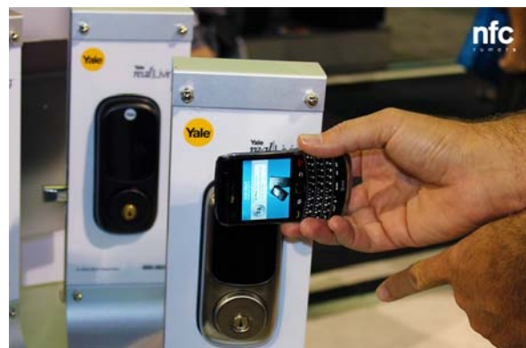
Figure 11: NFC Access control [19]

NFC access control application facility provides entry to any access control point like parking gates, tunnels, university entrance, and staff entrance to organization. This application can be used at any exit control point. NFC phone can also act as terminal for current RFID contactless cards. However it has the ability to integrate with Misfire technology [19].