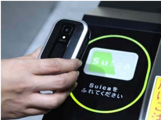
Figure 9: Presenting e-ticket to machine [17]

In this scenario cell phone is used as electronic wallet. Nowadays we are using cards only for payments. But with NFC equipped device multiple functions could be collected under the same platform. Virtual money can be loaded in the cell phone that can be used to pay travelling tickets or parking fee [16].