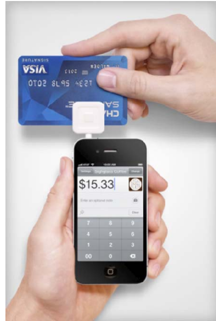
Figure 7 : Phone to Reader Transaction [14]

We can purchase and store electronic tickets on our cell phones. Cell phone can communicate with external reader by just touching it with reader. So one can purchase ticket easily instead of standing and waiting in a long queue