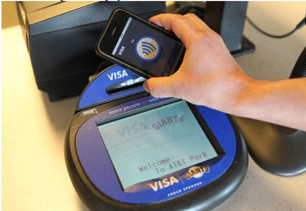
Figure 5: Phone to Device Transaction [12]

Here NFC equipped cell phone can communicate with any device. For example, by just touching phone with NFC equipped printer can print the pictures stored in cell phone. Or by touching payment device can perform payment transaction.