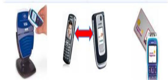
Figure 2 : Examples of NFC Communication Modes

Contactless communication supports this mode [7]. While in tag emulation mode NFC phone acts like smart card. For example, mobile as electronic wallet. Third mode is peer to-peer mode in which link level communication is established between two NFC phones. For example exchanging business cards.