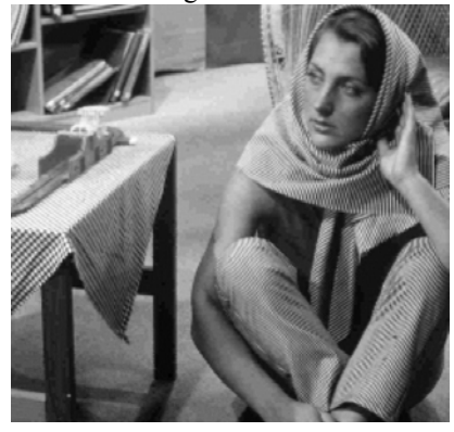
Fig. 1: Perceptual Performance of Pepper and Barbara image coding using proposed indexing method for Lattice Vector Quantization