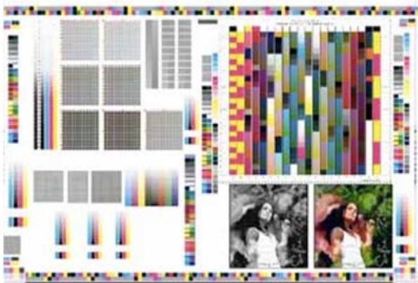
Figure 1: Neutral and colour image used for testing

The gray balance control is evaluated by density measurement, spectral measuring and comparison of print profiles [16]. The paper used in testing is a glossy paper 130g/m 2 . In printing a colour image and a neutral image is used as shown in figure 1.