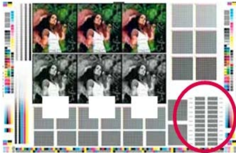
Figure3: The new test form for Printing 5, the red circle shows the hidden words inside the patches.

A subjective comparison and evaluation was done between the printed images based on new IT8 test chart [24]. In the first evaluation step the printed images separated with a profile based on printing 3 and 4 were tested. In second evaluation the test people found out which of these two images is more similar to image that was separated using ISOcoated_v2_300_eci.icc.