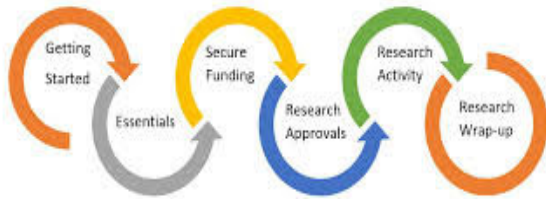
Fig. 2: The portal instruction relationship

Whether required to create the portal or required to make the portal available on the web [1]; Therefore, the follow-up and maintenance of the portal are one of the criteria for a good site, which appears clearly when evaluating the site, and which does not end without the disappearance of the portal, or the end of the purpose of the existence of the site on the Internet [3].