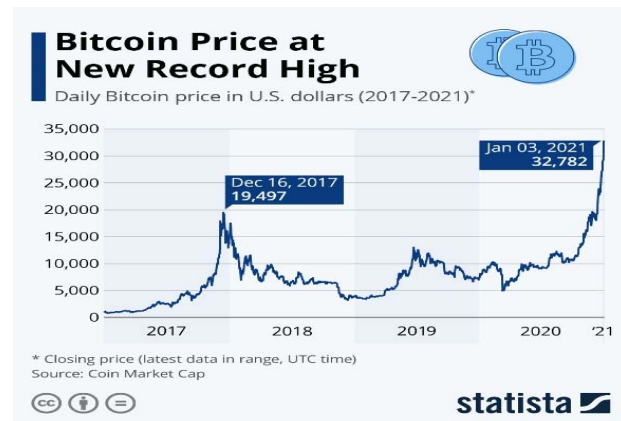
Fig. 1 Bitcoin change through 2017 – 2021

The price change raised the question of mining bitcoin cost for gaining benefits. Mining is a process for issuing a Bitcoin; this process needs use of software, such as GUIMiner, CG Miner, and BFGminer, and special hardware, such as like ASICMiner, AntMiner, and Avalon [1][2].