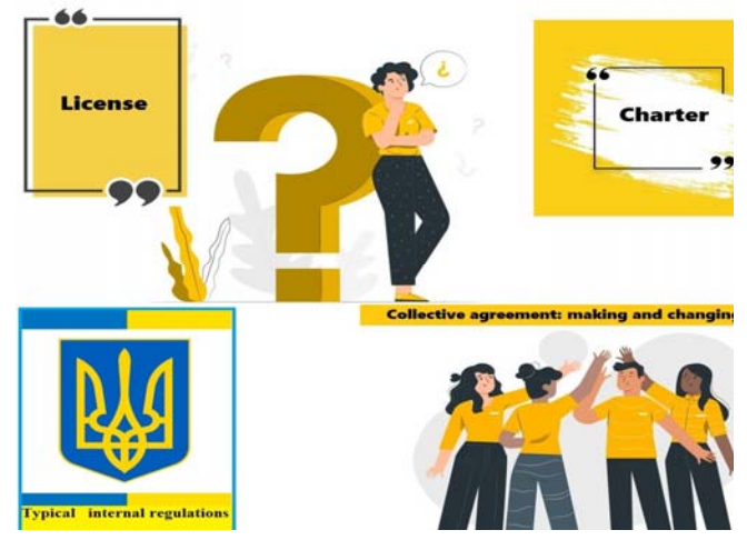
Fig. 3 Define the concept that is coded in the cross sense

Task: find the associative connection between the pictures. Determine what the task will be. (See Figure 3.)