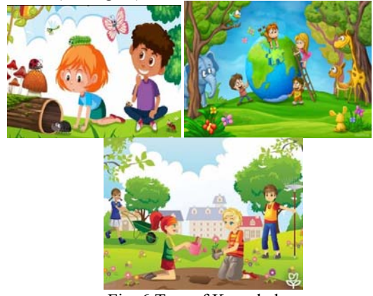
Fig. 6 Tree of Knowledge

In front of you is the "Tree of Knowledge". (See Figure VI).