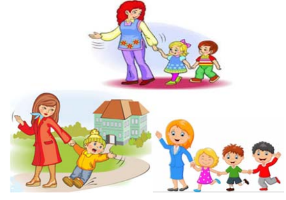
II – Formation of the basics of the child's life competence: (see Fig.4)

Fig. 4 . I - Formation of the basics of social adaptation and life competence of the child: