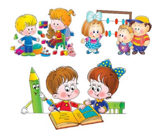
Fig. 5. III – nurturing elements of a nature-oriented worldview: (see Fig. V)