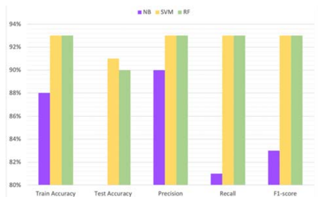
Fig. 2 Performance of the three classifiers without LDA features.

yielded valuable insights into the effectiveness of this approach for topical categorization of social media content. The analysis of results encompassed several facets, including cross-validation scores, training accuracy, and test accuracy, providing a comprehensive assessment of the model's performance. During the training phase, the NB model achieved an impressive accuracy rate of 92.20%. This high training accuracy highlights the model's capacity to effectively learn and categorize tweets based on the topics derived from LDA. It also suggests that the models successfully captured the underlying patterns within the training data, indicating a robust grasp of the inherent relationships between words and topics. In evaluating the model's performance on previously unseen tweets, the test accuracy was calculated at 82.75% for NB model. This test accuracy score demonstrates the model's proficiency in classifying cyberbullying tweets into their respective topics based on the information derived from the LDA topic modeling process. While the test accuracy may exhibit a slight reduction compared to the training accuracy, it remains commendably high, affirming the model's capability to generalize effectively to new and unseen tweet data. Figure 2 shows the performance metrics when LDA isn't employed as features into the classifiers.