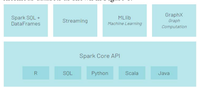
Fig. 1. Apache Spark Ecosystem [24]

Apache Spark are built on the top of Spark Core which is the foundation of parallel and distributed processing of enormous datasets as shown in Figure 1.